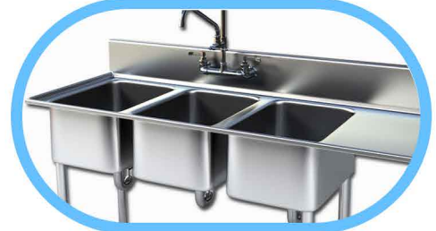
TRIPLE BOWL SINKS