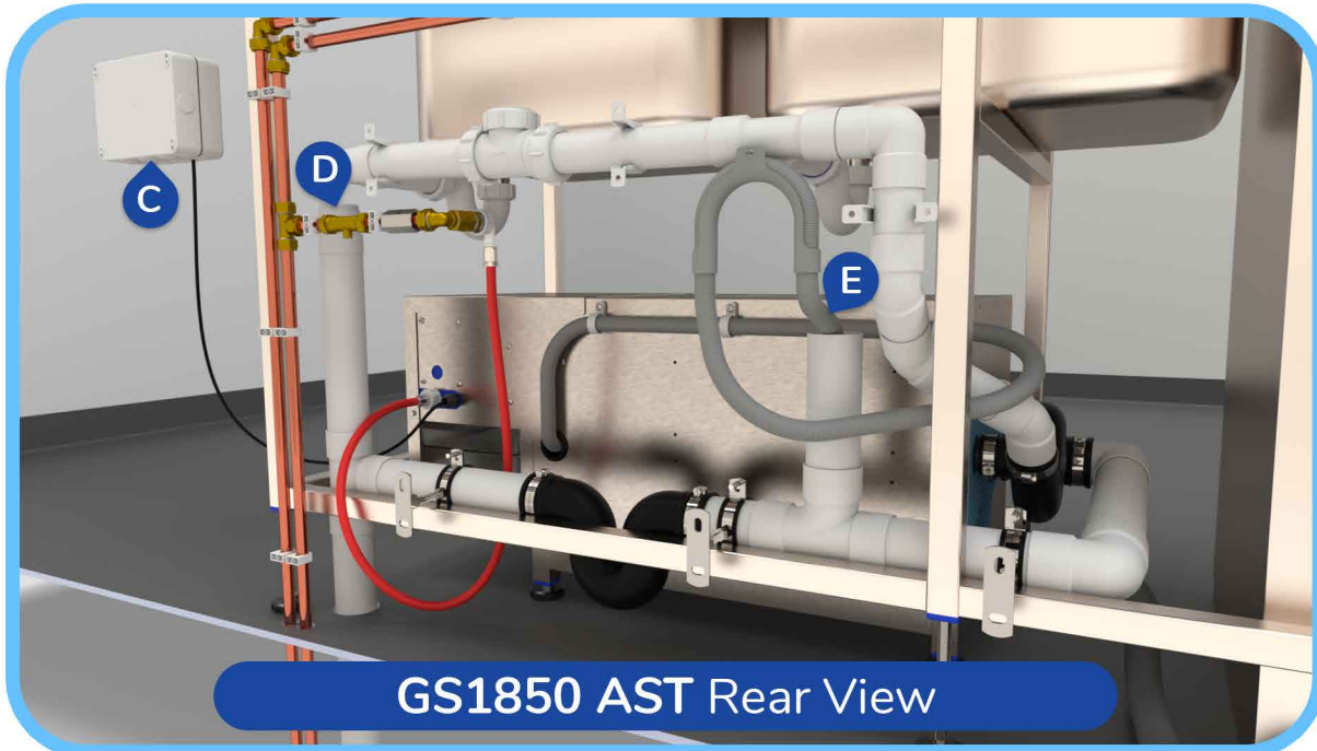
GS1850 AST Rear View