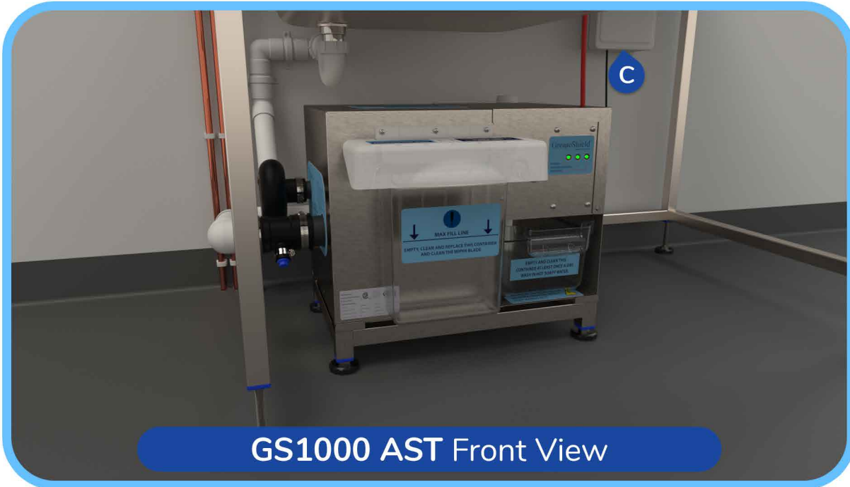
GS1000 AST Front View