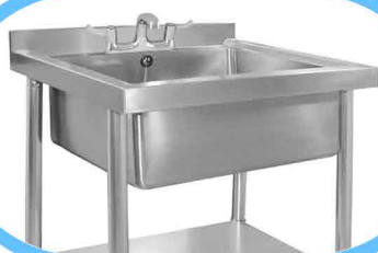
SMALL POTWASH SINKS