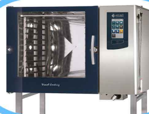
SMALL COMBI OVENS