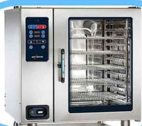
STEAM COMBI OVENS